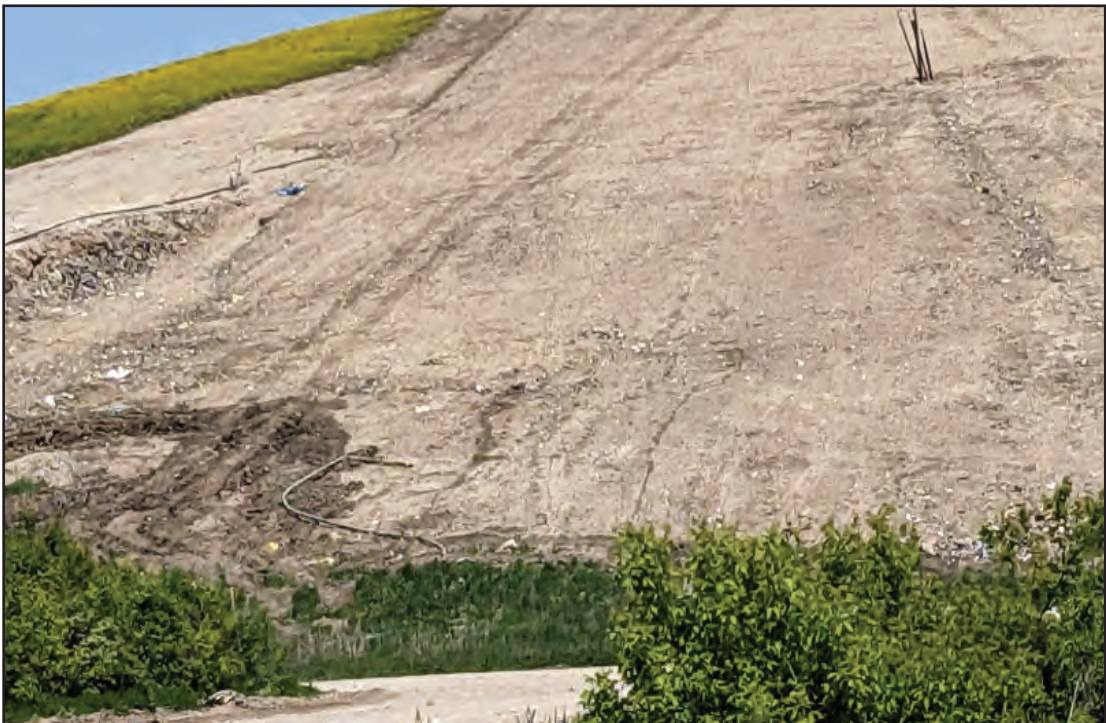
Waste grades restored and cap being prepared with clay layer