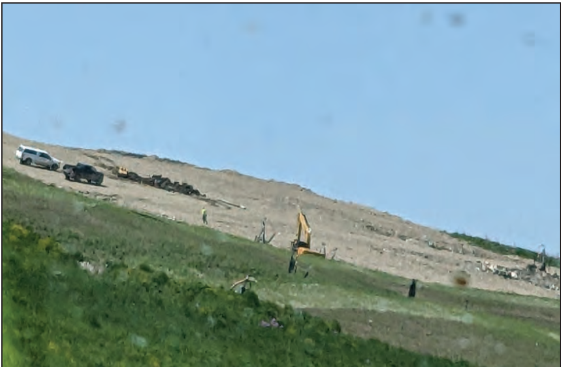
Waste grades restored and cap being prepared with clay layer