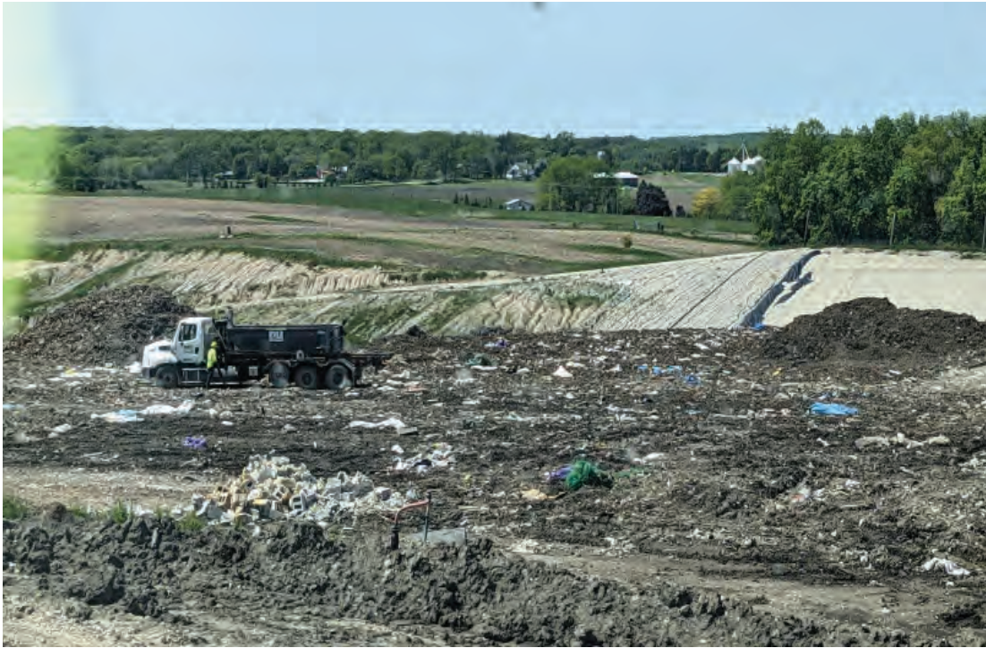
Active area of Phase 4b