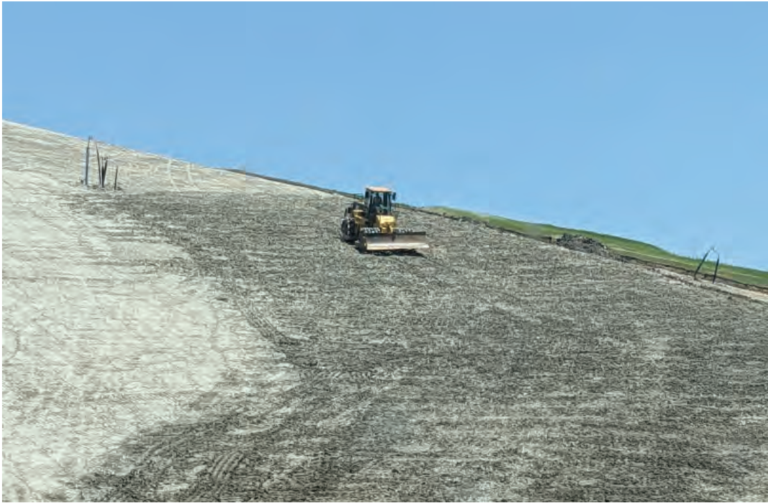
Waste grades restored and cap being prepared with clay layer