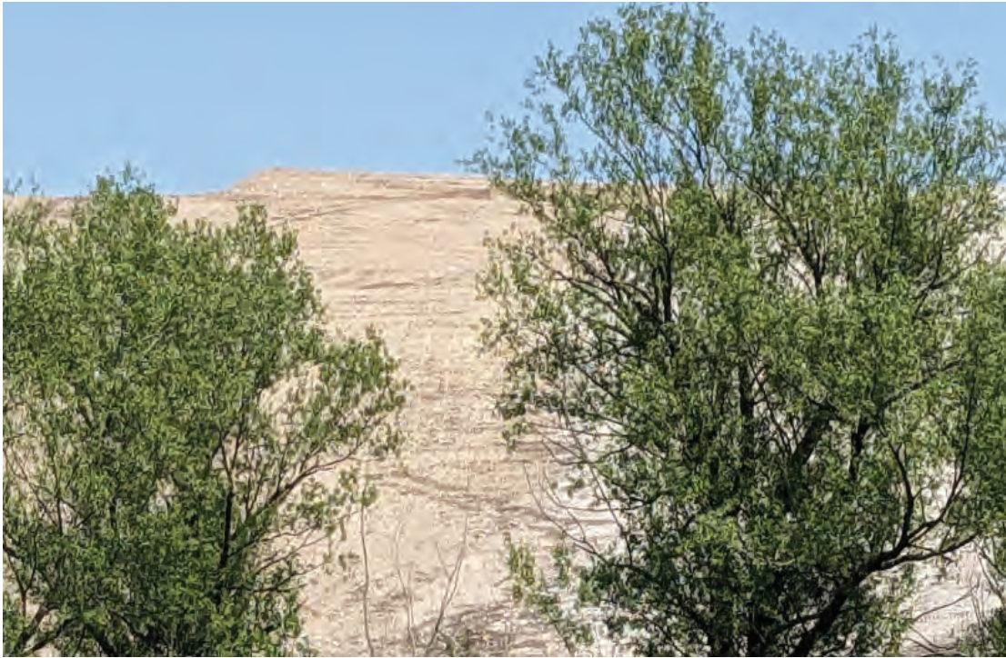
Waste grades restored and cap being prepared with clay layer