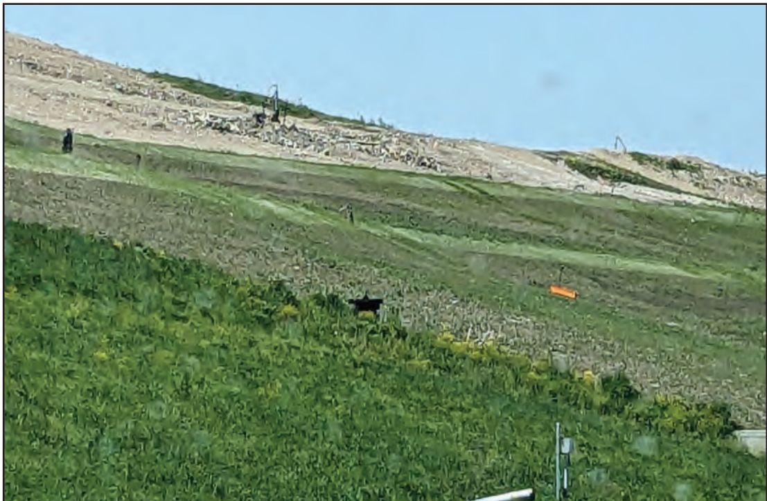
Previous cap project vegetation covering cap