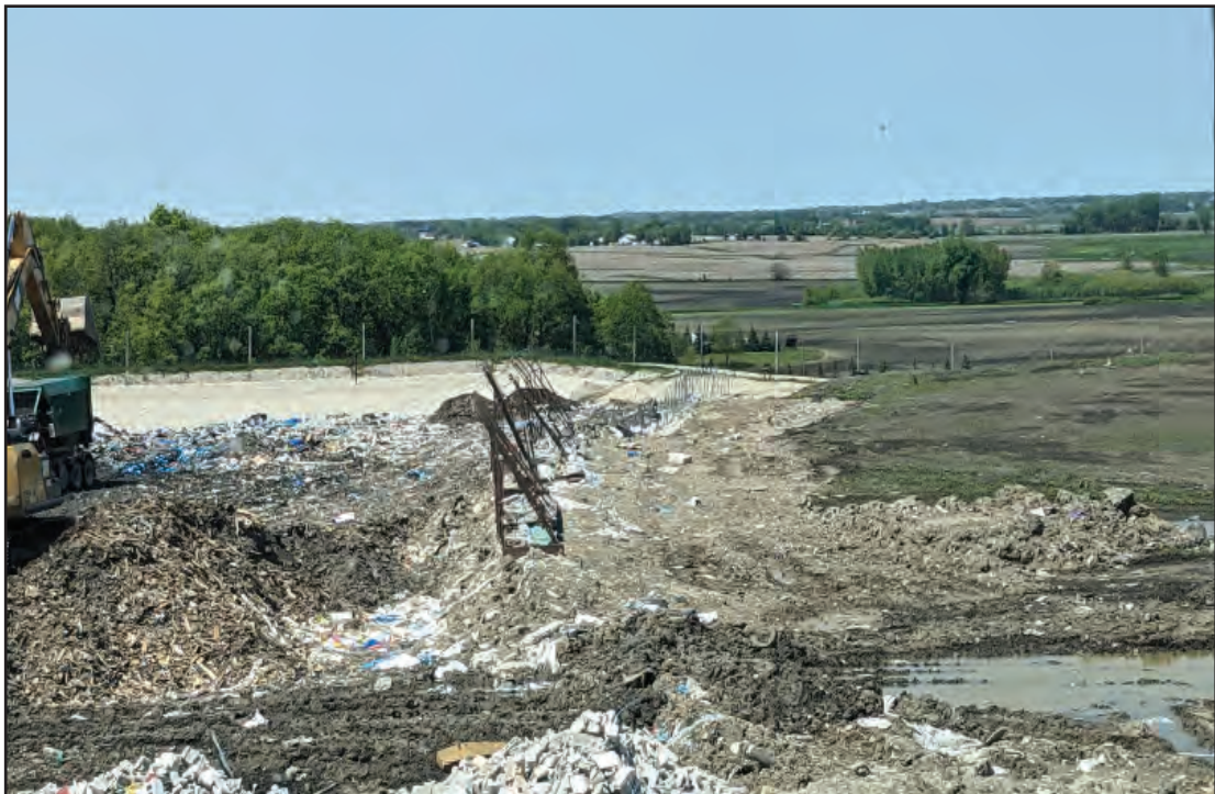
Active area of Phase 4b