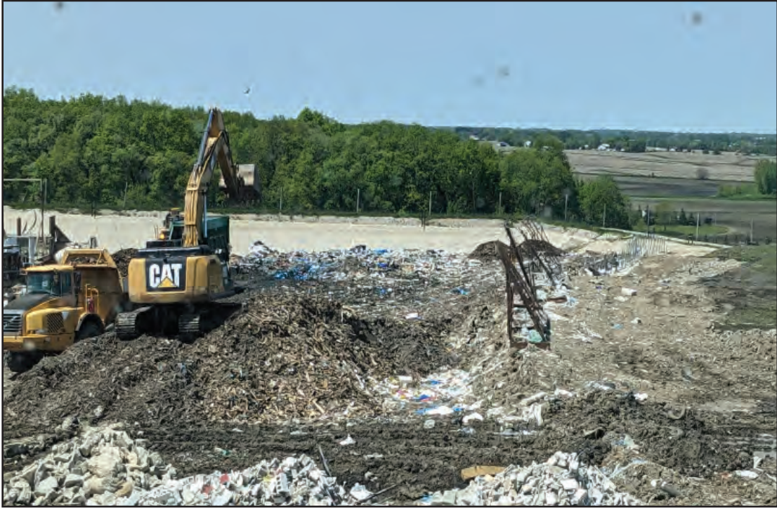
Active area of Phase 4b