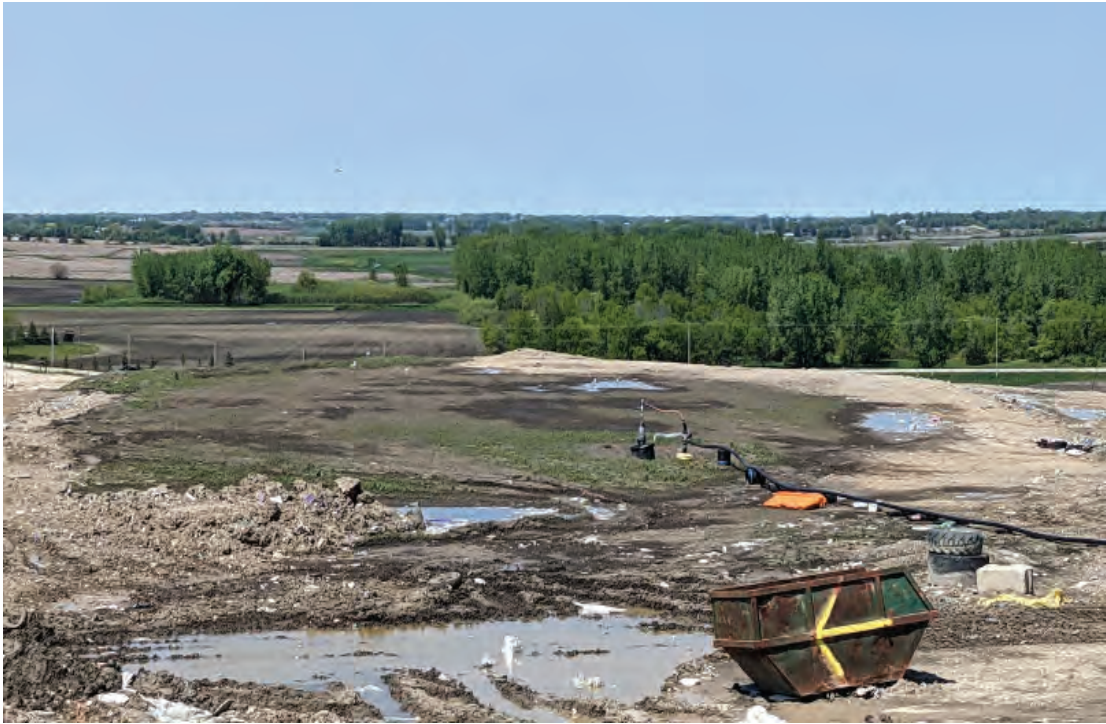
Phase 4; covered until waste placement