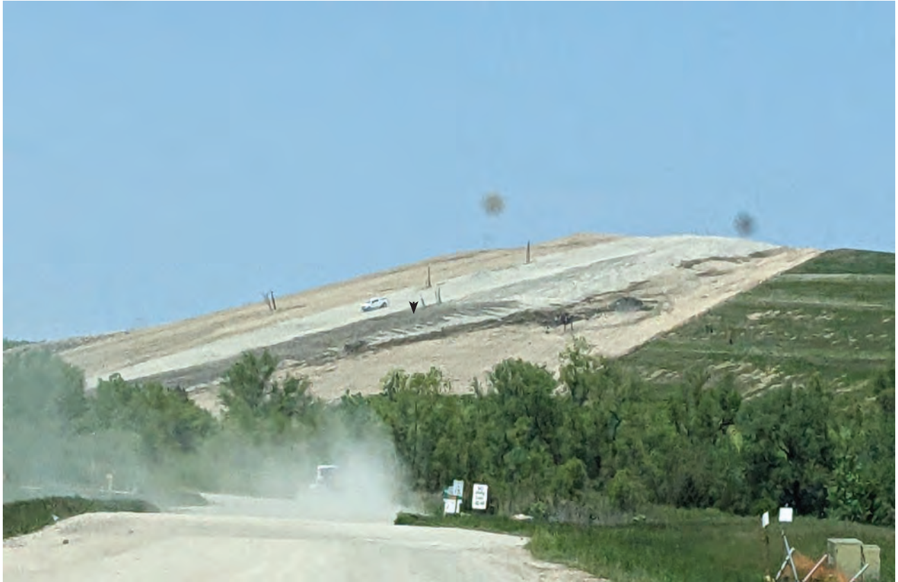
Waste grades restored and cap being prepared with clay layer