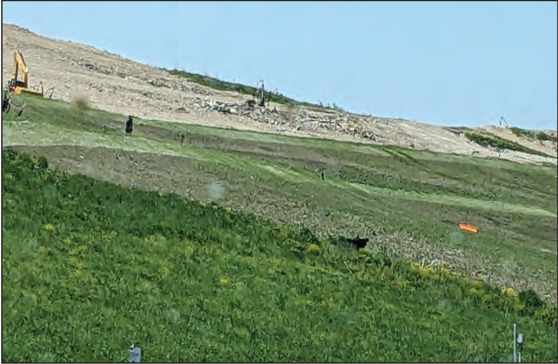
Previous cap project vegetation covering cap