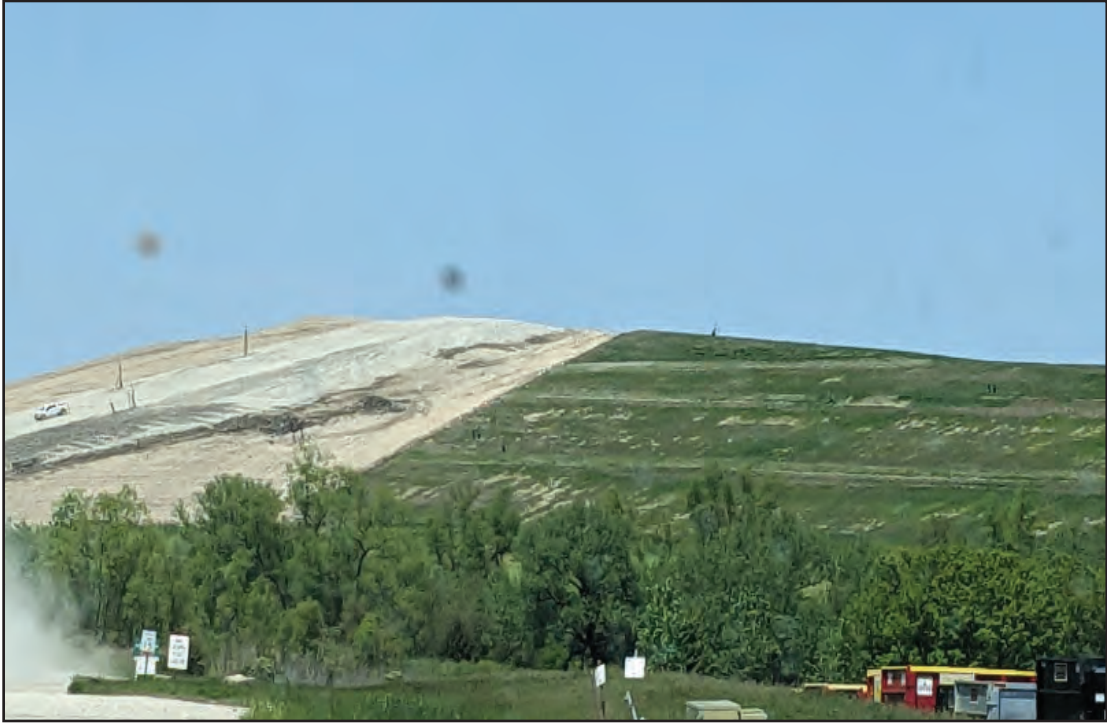
Junction of cap projects