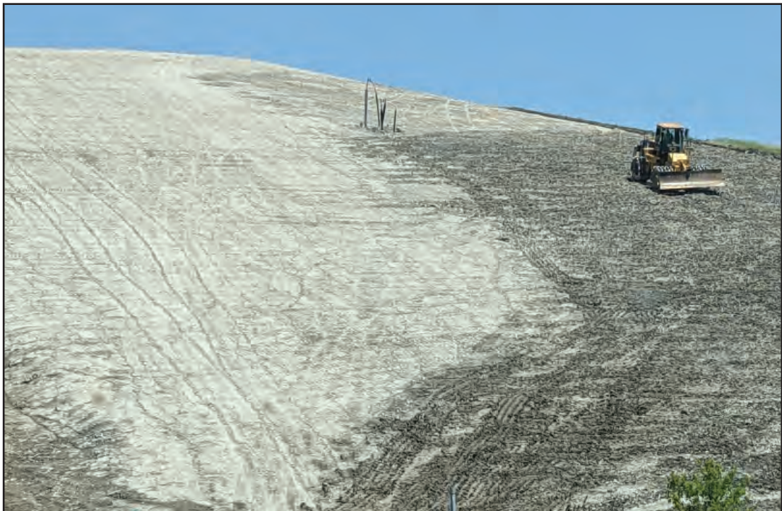
Waste grades restored and cap being prepared with clay layer