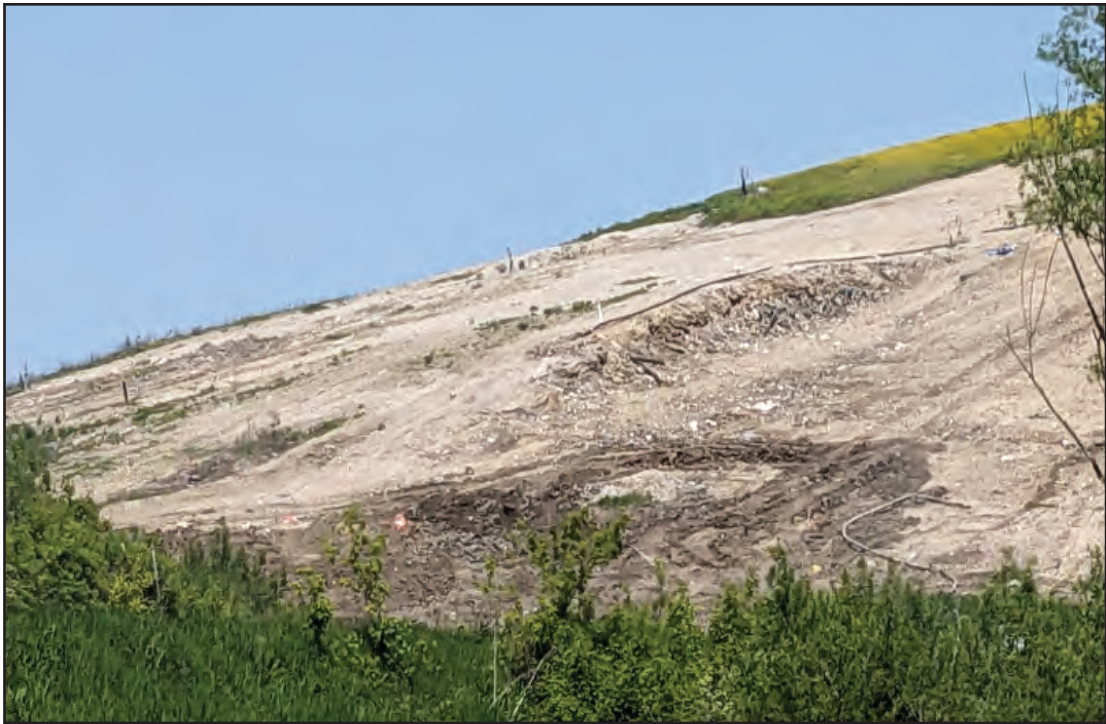
Phase 3 slopes outside of cap project