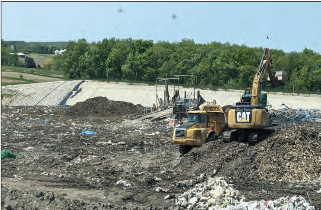
Active area of Phase 4b