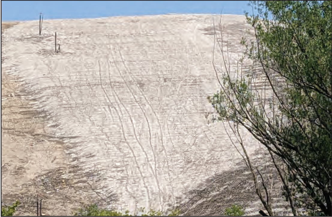
Waste grades restored and cap being prepared with clay layer